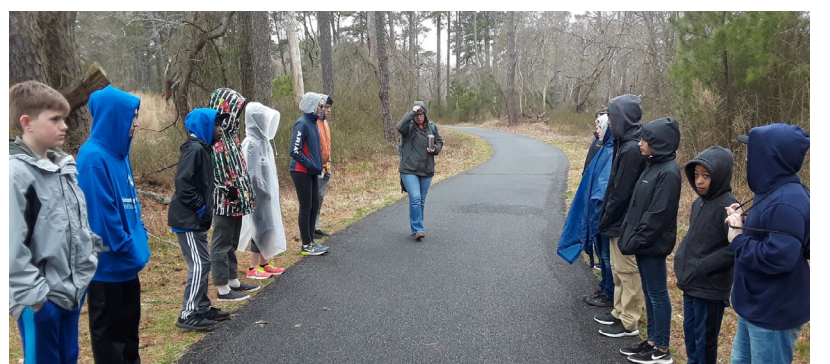
Students trek through “Maritime Forest” on their final day on Chincoteague Bay Island.