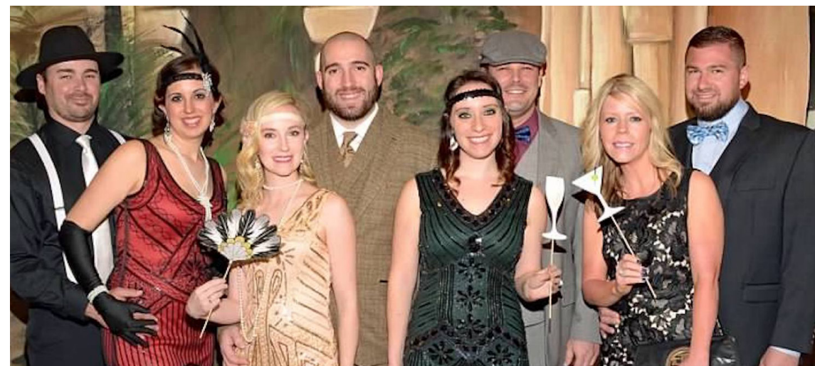
Guests pose for a group photo dressed in their best “Great Gatsby” attire. The entire evening was full of theme attire and fun activities such as “Heads or Tails” (below).