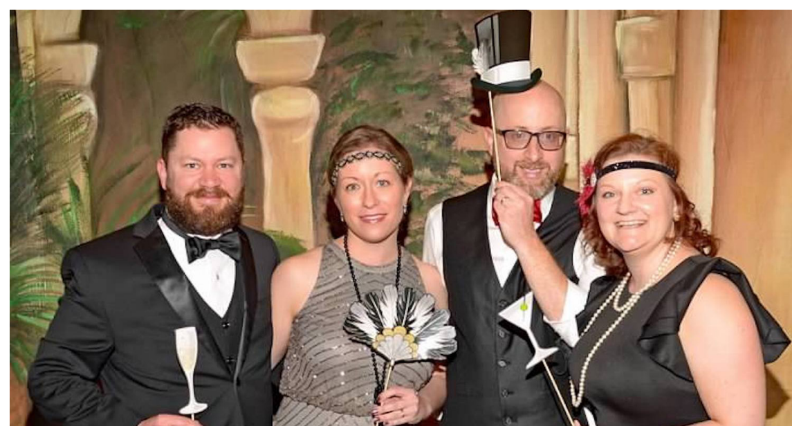
We want to thank Magnolia Green Golf Club for allowing Millwood School to rent out its wonderful spaces (inside and out) to celebrate our annual gala this year!