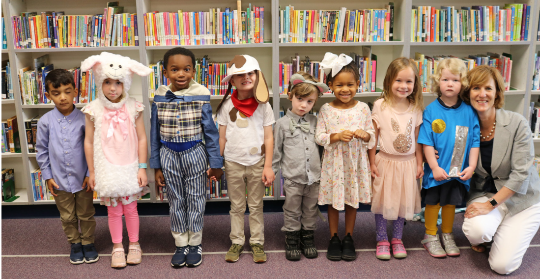
JK poses for a class photo after presenting their nursery rhymes which they had to memorize and present in front of their parents.

In April, the JK students were ready to use their public speaking skills that they have been working on all year long. They dressed up and recited nursery rhymes to their families. The students demonstrated their skills by making eye contact with the audience, singing loudly and clearly, as well as smiling and showing they were having fun. In addition, the students integrated Spanish by singing Twinkle, Twinkle Little Star as a group in English and Spanish.