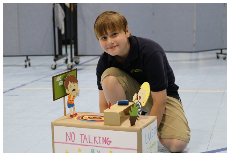
4th Grade students created a variety of floats in representation of the books they read.

Each month, the fourth graders read a book from a different genre and complete a project. The Book Float Parade is the project in which they are free to choose a book from any genre and then design a float to share with the Millwood Community. They depict a scene from the book, or create a visual of the theme of the book.