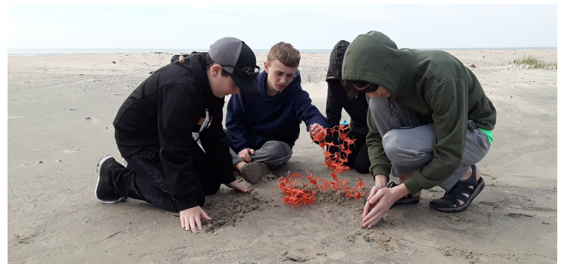
There were many skills to be learned on this journey and some involved working in the sand.